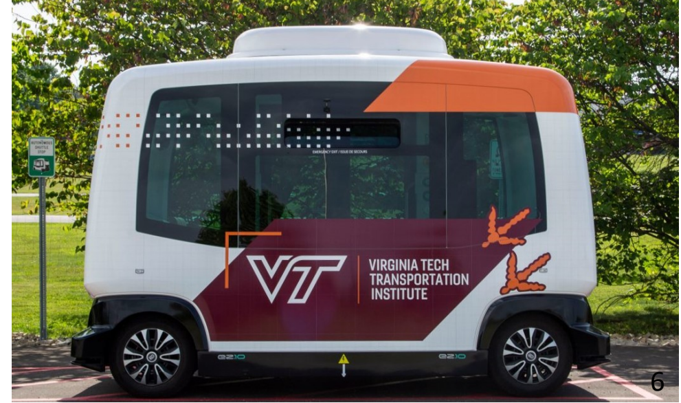
EasyMile EZ10 shuttle.