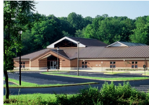
George Mason Regional Library