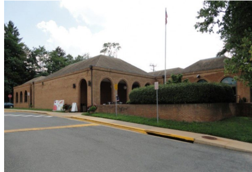
Patrick Henry Community Library