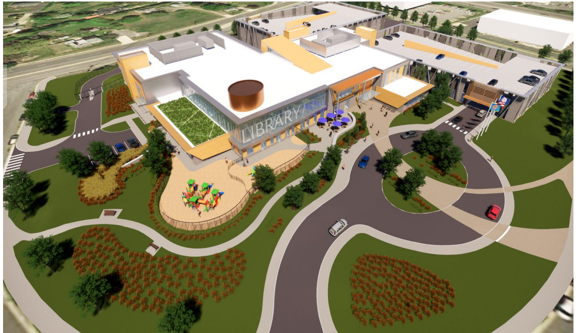
Public Entrance Elevation from Silver Lake Blvd.