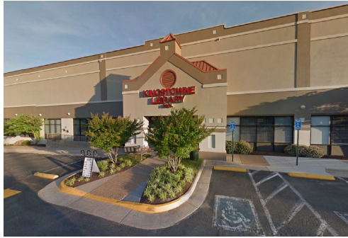
Kingstowne Regional Library