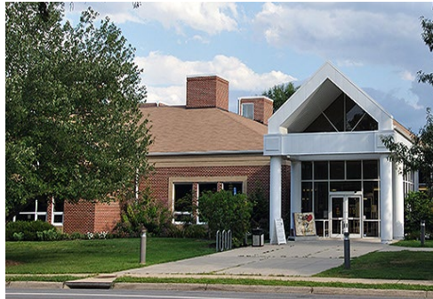
Sherwood Regional Library