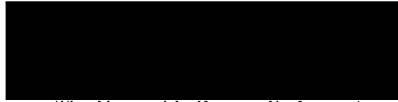
The Honorable Penney S. Azcarate CHIEF JUDGE

Compliance with Rule 1:13 requiring the endorsement of counsel of record is modified by the Court, in its discretion, to permit the submission of the following electronic signatures of counsel in lieu of an original endorsement or dispensing with endorsement.