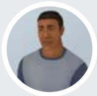
Antoine: Screen for mental health and substance use

Learn effective techniques to discuss mental health and substance use with adult patients in a primary care setting.