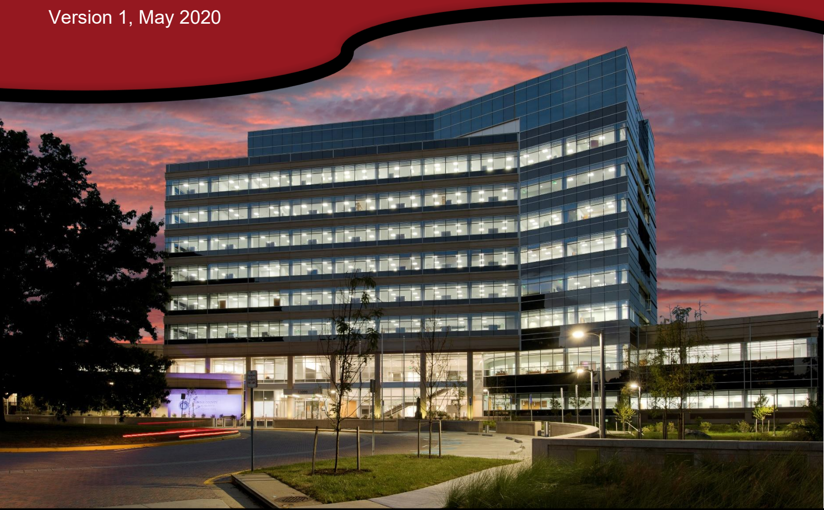
Public Safety Headquarters

Office of the Fire Marshal Engineering Plans Review Branch 12099 Government Center Parkway, 3 rd floor Fairfax, VA 22035 Tel: 703-246-4806, TTY 711 Fax: 703-246-6043 Email: fire.engplansreview@fairfaxcounty.gov OFM Homepage – https://www.fairfaxcounty.gov/fire-ems/fire-marshal