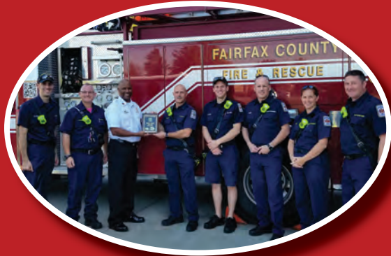
Battalion 3 - FS15