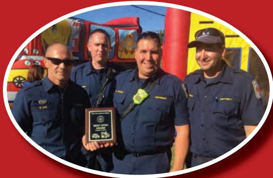
Battalion 1 - FS39