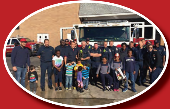
Battalion 6 - FS11

Congratulations to each of the winning stations!