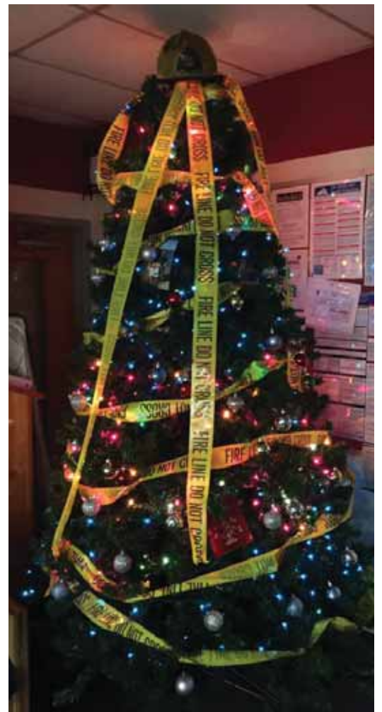
Fire Station 36, Frying Pan, got creative with their tree decorations this year.