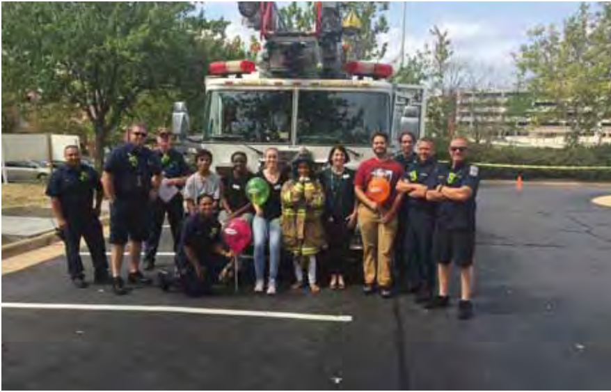
Fire Station 22, A-Shift, participated in a Kids Day event at the Old Navy in Springfield on October 3. Representatives from police, fire, and other agencies were on hand to visit with kids and parents.