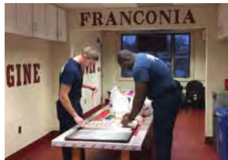
On December 6, Fire Station 5, Franconia, cooked breakfast for the police officers that work in their community as a way to say thank you for protecting and serving. French toast, bacon, sausage gravy, and scrambled eggs were prepared by the firefighters. Thank you to our brothers and sisters in blue for all you do!