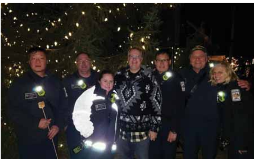
Fire Station 16, Clifton, was on hand at the town's annual Christmas Tree lighting.