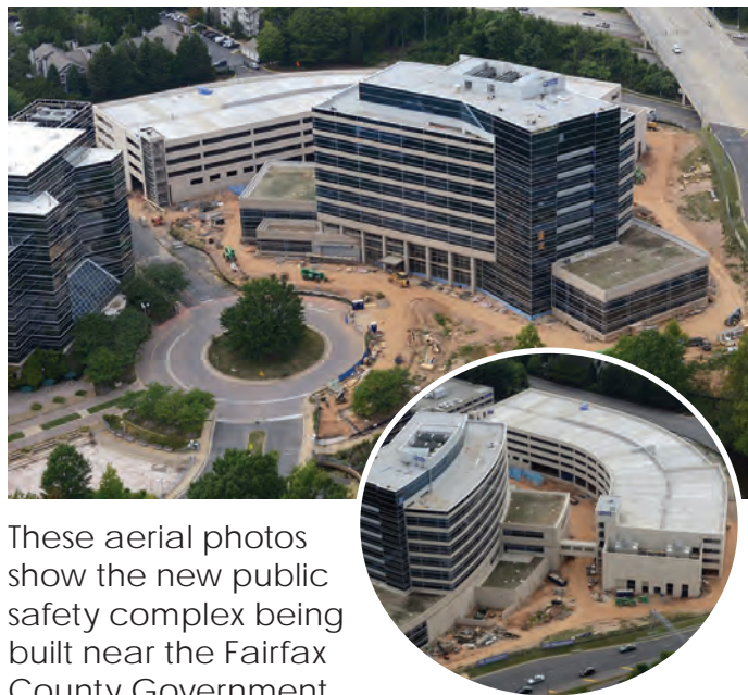
These aerial photos show the new public safety complex being built near the Fairfax County Government Center. The new building is anticipated to open in fall 2017 and will house police and fire.