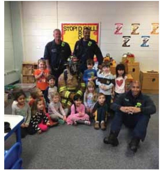
Fire Station 27, West Springfield, C-Shift made some new friends at the West Springfield High School Spartan Sprouts Preschool program on November 9.