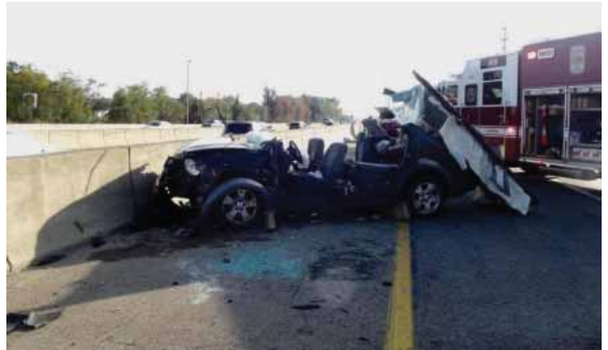
Multiple Vehicle Collision: Wednesday, November 2, 2016. At approximately 3:25 p.m., Units from Battalion 6 were on the scene of a multiple vehicle collision with a person trapped on I-95 Southbound prior to Lorton Road.