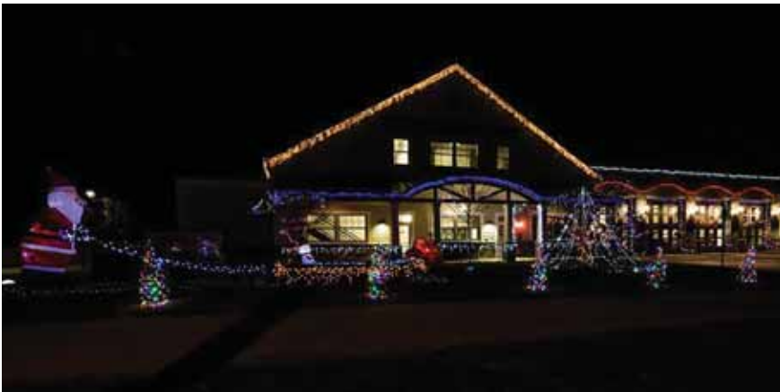
Fire Station 12, Great Falls, showed their holiday spirit with a spectacular light display outside the fire station.