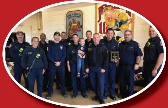
Battalion 4 - FS18