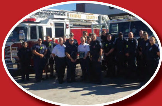
Battalion 5 - FS22