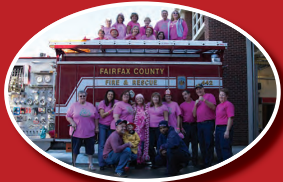
Battalion 2 - FS42