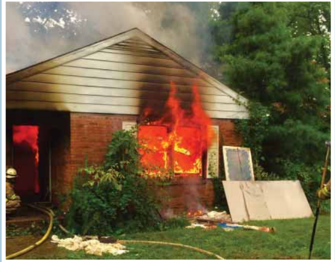
On Saturday, October 1, fire and rescue stations from the 4th Battalion participated in an acquired structure training fire at 4624 Willow Run Drive in the Annandale area of Fairfax County. An acquired structure is one in which a home or building is donated to the fire department by the owner(s) as the structure is set to be demolished for a variety of reasons.