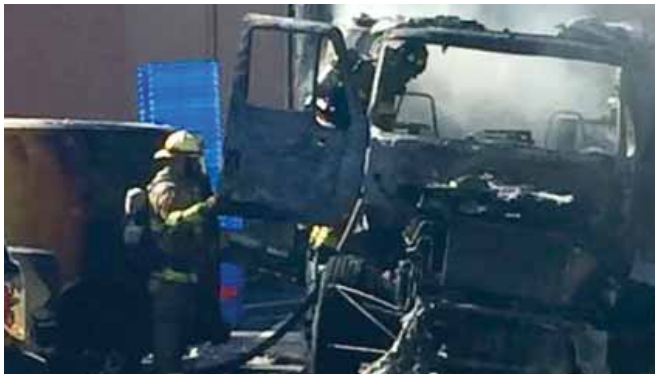
In the Burke area of Fairfax County, units from Battalions 4, 5, and 7 responded to a tractor trailer fire behind a building in the 8900 block of Burke Lake Road.