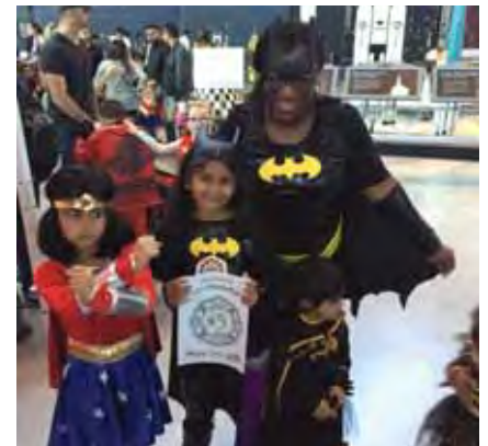
In October the Life Safety Education crew spent time talking about fire prevention and safety at the National Air and Space Museum's Air and Scare, the annual Halloween event at the Udvar-Hazy Center in Chantilly, Virginia.