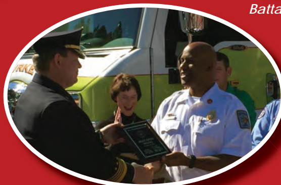
Battalion 7 - FS14

Congratulations to each of the winning stations!