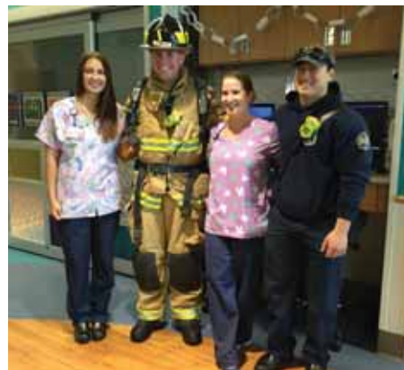
Once a month a crew from one of Fairfax County Fire and Rescue Department's fire stations stops by Inova Children's Hospital to visit with kids, parents, and staff. The firefighters answer questions, show off their gear, and try to brighten the day of everyone they meet.