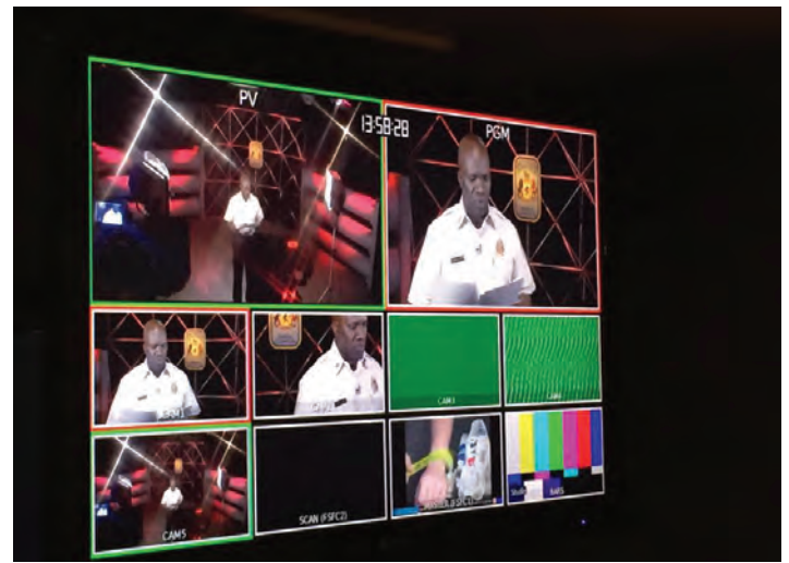
Did you know the Fairfax County Fire and Rescue Department has a segment on Channel 16? Fire and Rescue Digest debuts quarterly and highlights programs and happenings within the department. You can view current and past episodes at the Fairfax County YouTube page.