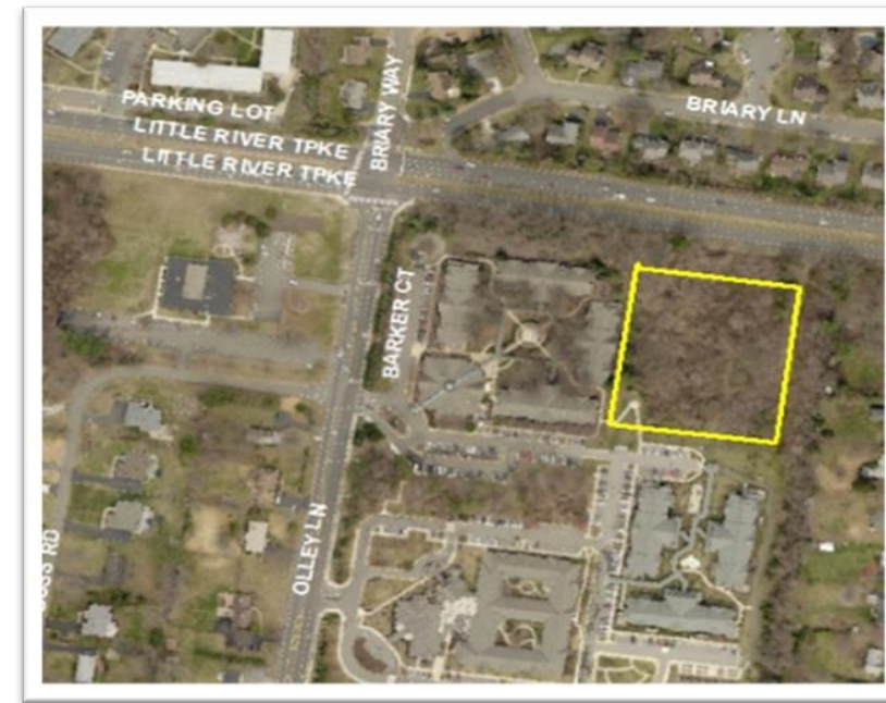
Little River Glen