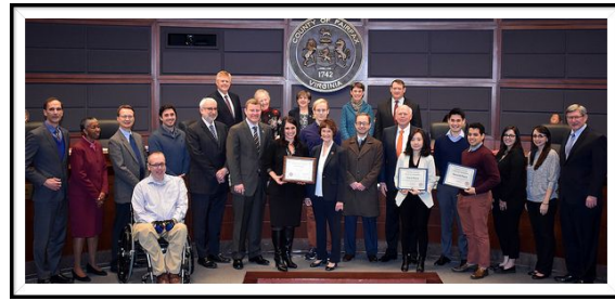
The three winning teams, judges and mentors who participated in the Housing Hackathon in January 2019.

To view the March 5, 2019 Board Package click here .