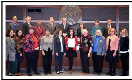
March 2019 Women's History Month