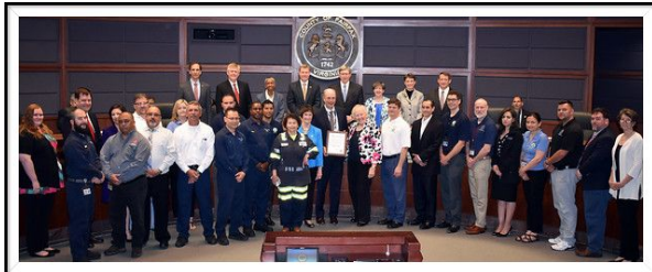
May 19-25, 2019 Public Works Week