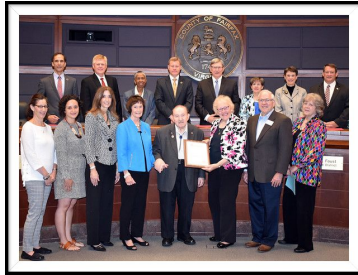
May 2, 2019 Holocaust Remembrance Day