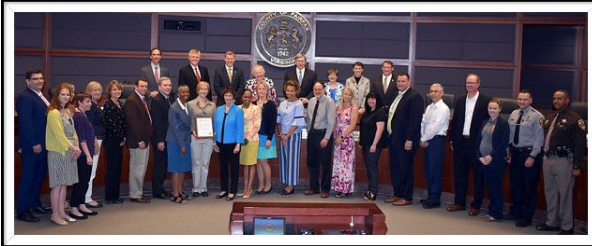
May 9, 2019 Children's Mental Health Awareness Day