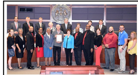
June 2019 Fatherhood Awareness Month

To view the May 7, 2019 Board Package click here .