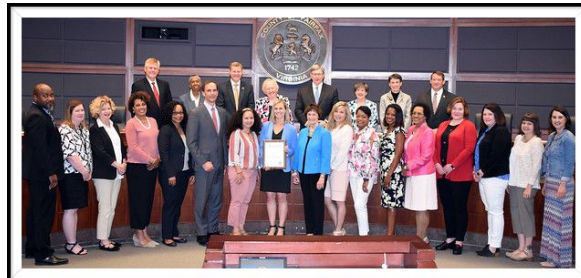
May 2019 Foster Care Awareness Month