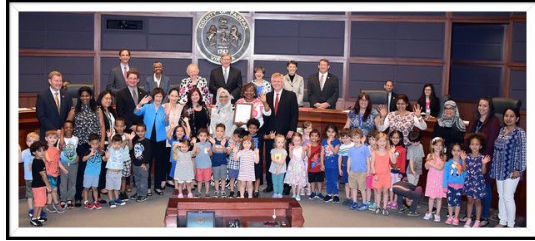
May 5-11, 2019 Child Care Professional Week