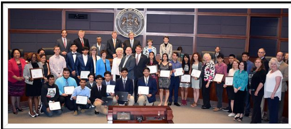
Shark Tank Technology students for their achievements and contributions to our community