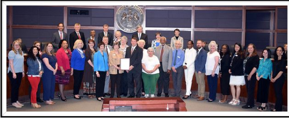
May 2019 Older Americans and Adult Abuse Prevention Month