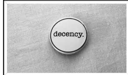
May 14, 2019 Day of Decency