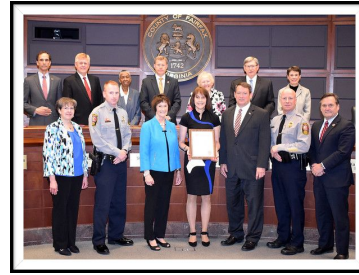
May 7, 2019 Peace Officers Memorial Day and May 11-18, 2019 Police Week