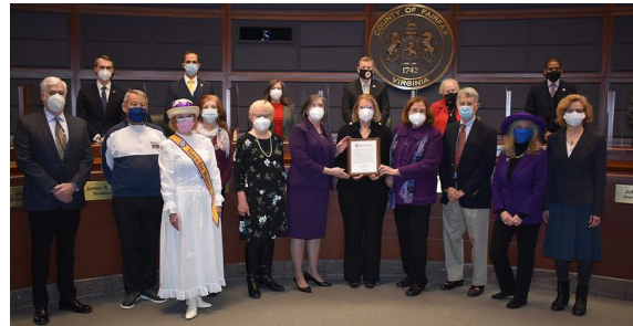
Turning Point Suffragist Memorial Association