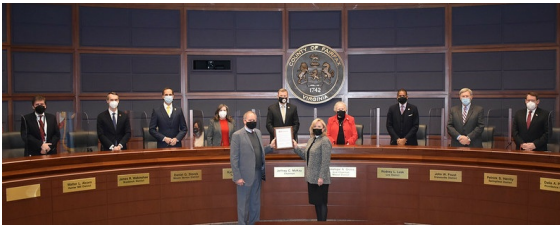
Pohick Church 75th Annual Country Fair