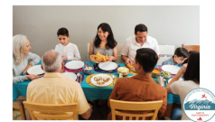
Staying Home: Making Smart Choices for Easy Living