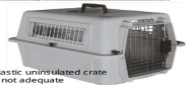
Plastic uninsulated crate is not adequate