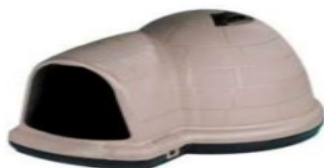
Insulated with door weather flap