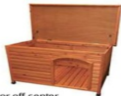
Door off center Top opens for easy cleaning