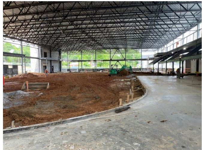
Left: Shown is the new rink and upper-level indoor walking track prior to concrete being placed. The angled steel in the background indicates the future location of bleachers.