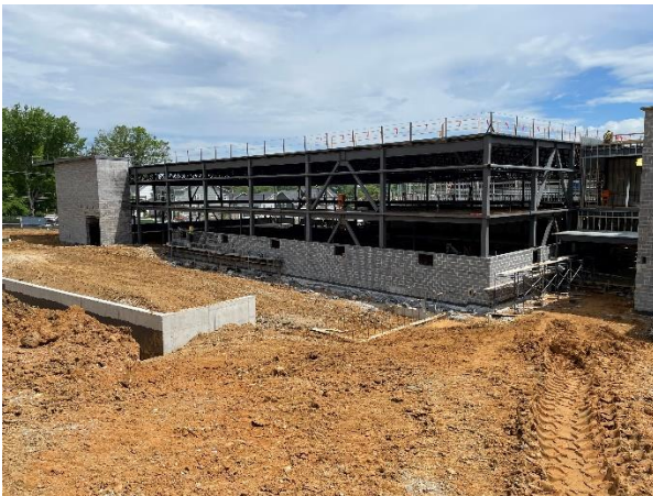
Left: Excellent progress being made on the construction of the second rink.

Construction progress remains on schedule for the rec center's renovation and expansion. Steel structural framing is nearly complete, so the building's final form is much more apparent from the outside. That predominantly includes the addition of a second ice rink, expanding the fitness area as a two-level amenity, and relocating the facility entrance to the second level. Most of the under-slab utilities have been installed, and interior metal framing and masonry are underway. Ductwork has begun in some areas.