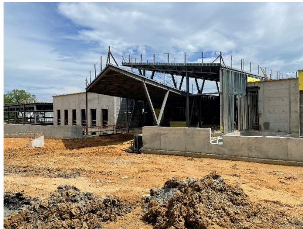
Right: The main entrance will be on the second level and located closer to the parking lot.