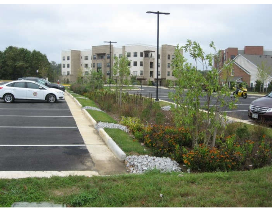
Tree Conservation Award Winning Projects