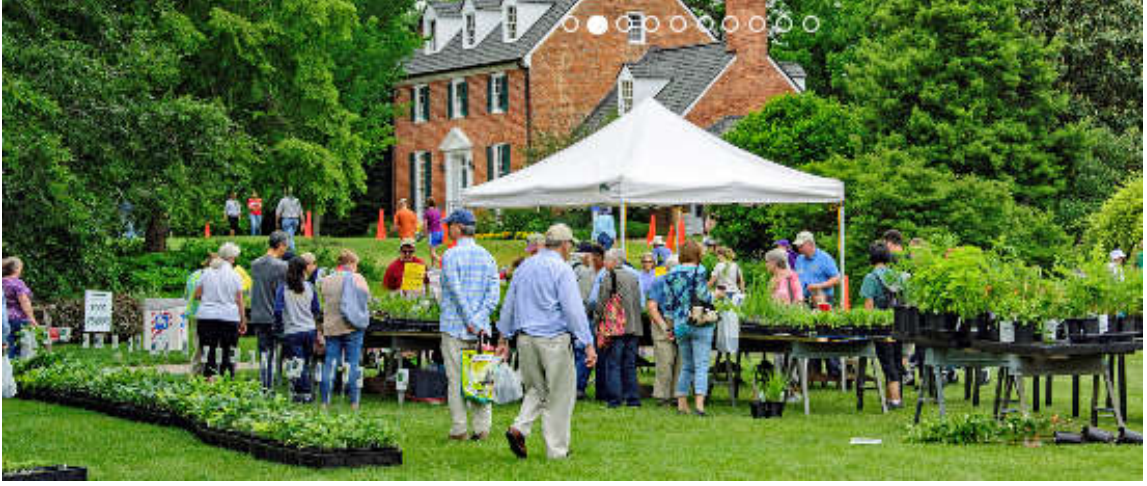
Green Springs Gardens Park (Mason District)