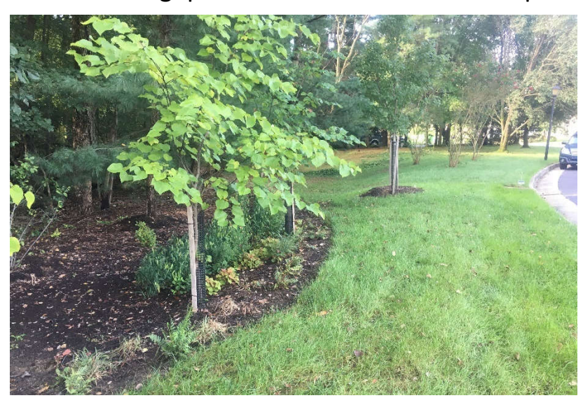
Surrey Court HOA (Mt Vernon District)