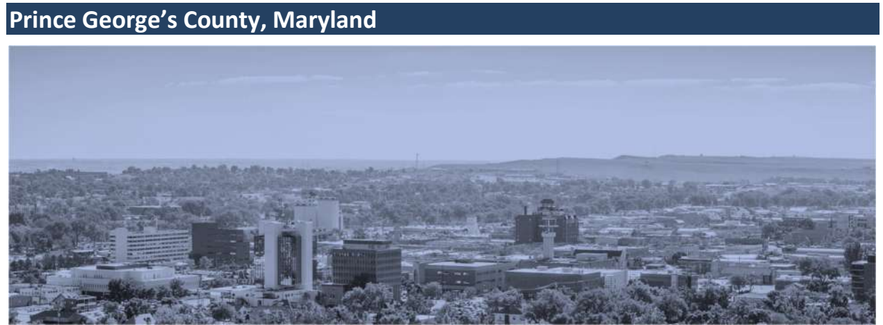
Population: 909,535 | Land Area: 499 square miles

ordinance also includes several boundary maps to clearly identify where different zoning standards apply. Helpful summary tables for procedures, dimensional tables, and uses are also provided. The use tables are divided by residential, commercial, industrial, and special purpose districts.