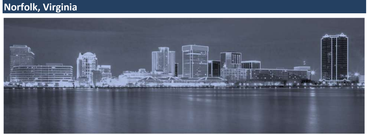
Population: 246,393 | Land Area: 96 square miles

There are some weaknesses in this ordinance. The document is fairly lengthy at 600 pages, which is due in part to the inclusion of numerous graphics. Although the five article structure is simple, some communities might find it over-simplified. For example, development review and approval procedures are located within the Article 1: General Provisions, which might be difficult for a user to find. Some communities choose to list those procedures in a stand-alone article. Finally, Clarion typically recommends that definitions be located at the end of the ordinance in a separate article, where they do not interrupt the hierarchy of information for the majority of readers who do not need to consult specific definitions.