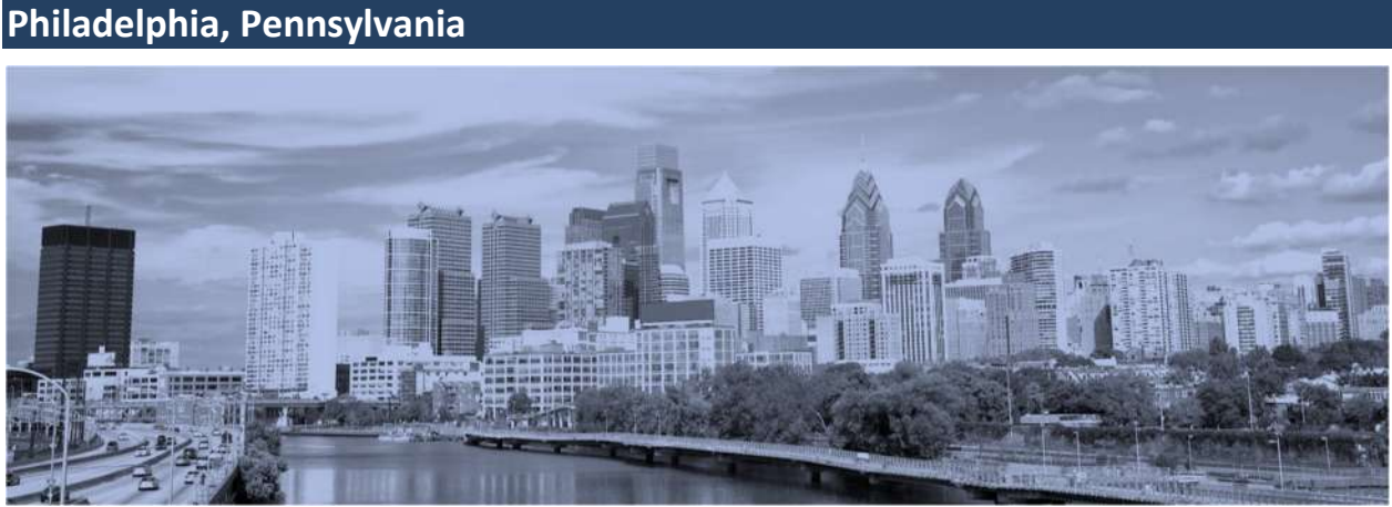
Population: 1.568 million | Land Area: 142 square miles

The Zoning Ordinance is over 800 pages in length, which is fairly lengthy, but this is partly due to the page formatting, which provides lots of white space, wide margins, and nested text. The subdivision regulations are a separate document, which may make it more difficult to keep procedures, organization, and standards consistent between zoning and subdivision. The nonconformities and enforcement articles could potentially have been grouped under the administration article rather than keeping certain types of procedures separated from other common procedures. Finally, flowcharts illustrating the steps in each review and approval procedure would make the ordinance more user-friendly.