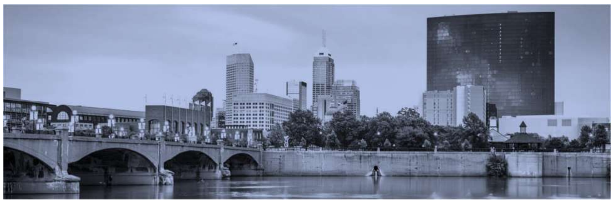
Population: 939,020 | Land Area: 403 square miles