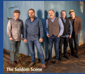
The Seldom Scene