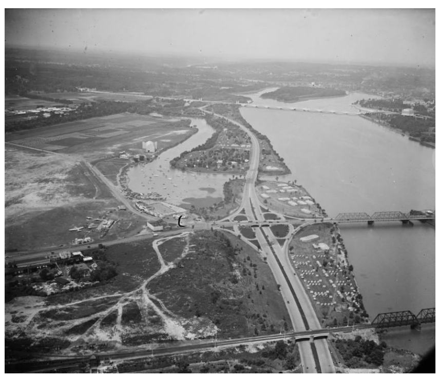
George Washington Memorial Parkway in 1935.

Did you know that Congress authorized the construction of Mount Vernon Memorial Highway in May 1928? The GW Parkway opened with enormous fanfare on January 16, 1932 - just in time for the nationwide celebration of the bicentennial of Washington's birth. Click <u>here</u> to learn more.