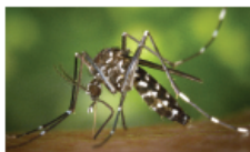
( Aedes albopictus , or Asian tiger mosquito, is common in Northern Virginia.)