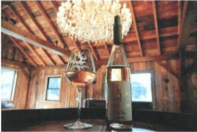
Paradise Springs Winery 13219 Yates Ford Road, Clifton, Virginia www.paradisewinery.com/Home