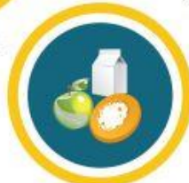
SUPER SNACK BREAKFAST