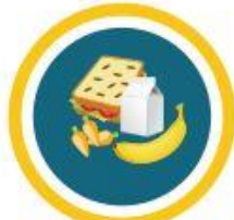
SUPER SNACK LUNCH

A federally funded, state administrated program through the USDA's Summer Food Service Program.