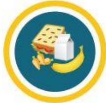
SUPER REFRIGERIO ALMUERZO

Este programa esta fundado federalmente e administrado por el estado a través del programa de servicio de comida de verano del USDA.