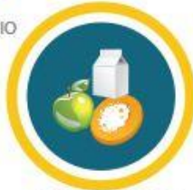
SUPER REFRIGERIO DESAYUNO