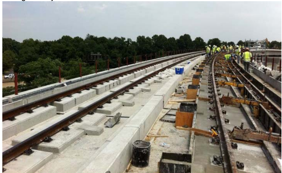
(Aerial track near Chain Bridge Rd & Dulles Connector Rd. Outbound track on the left. 07/2011)