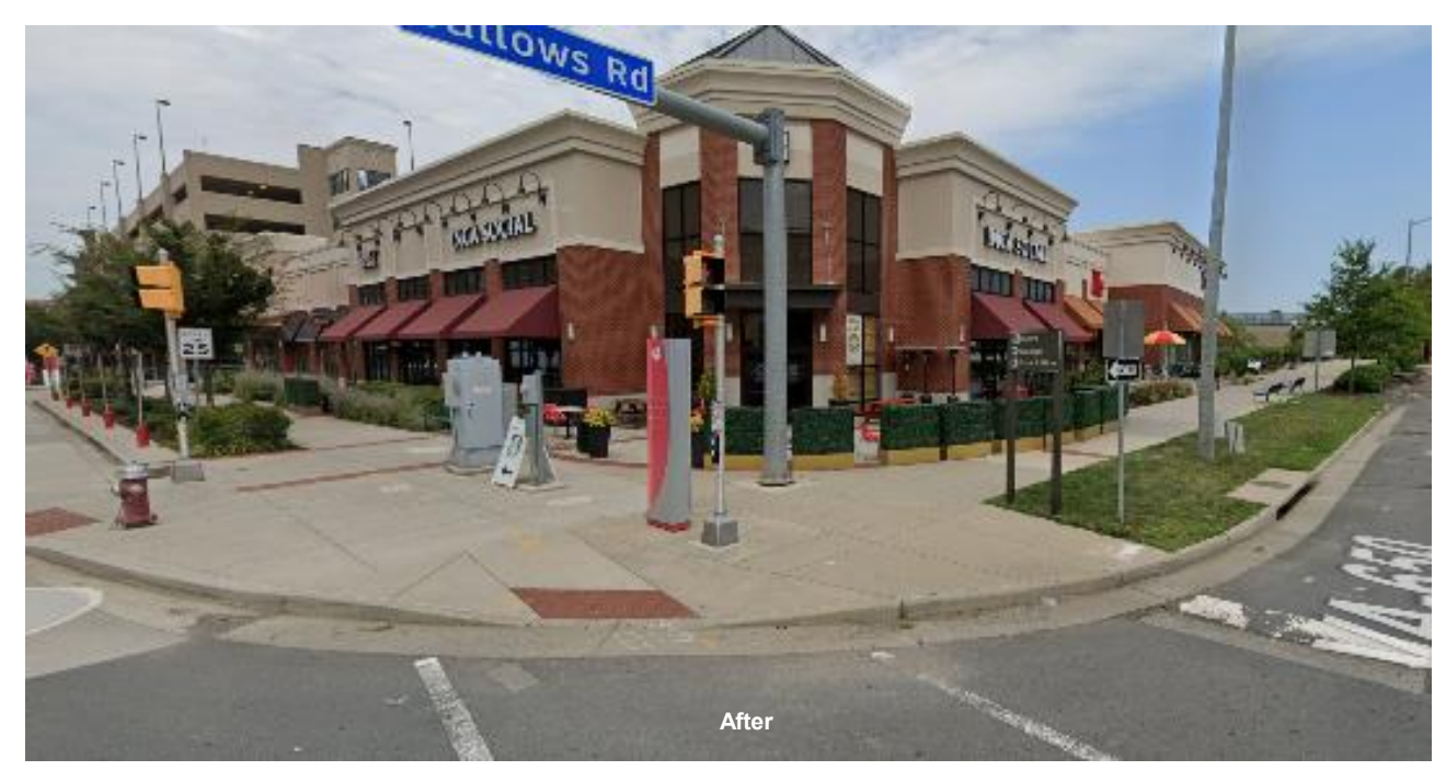
Gallows Road and Avenir Place at Dunn Loring - Merrifield Metrorail Station