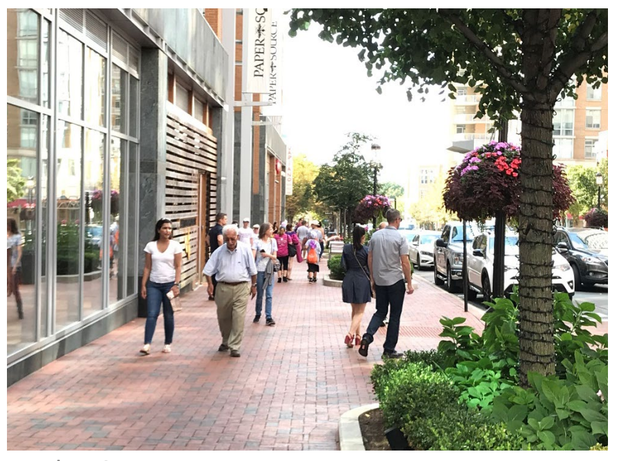
Market Street, Reston