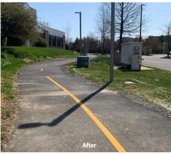
Sunrise Valley Drive at Herndon Metrorail Station, Reston