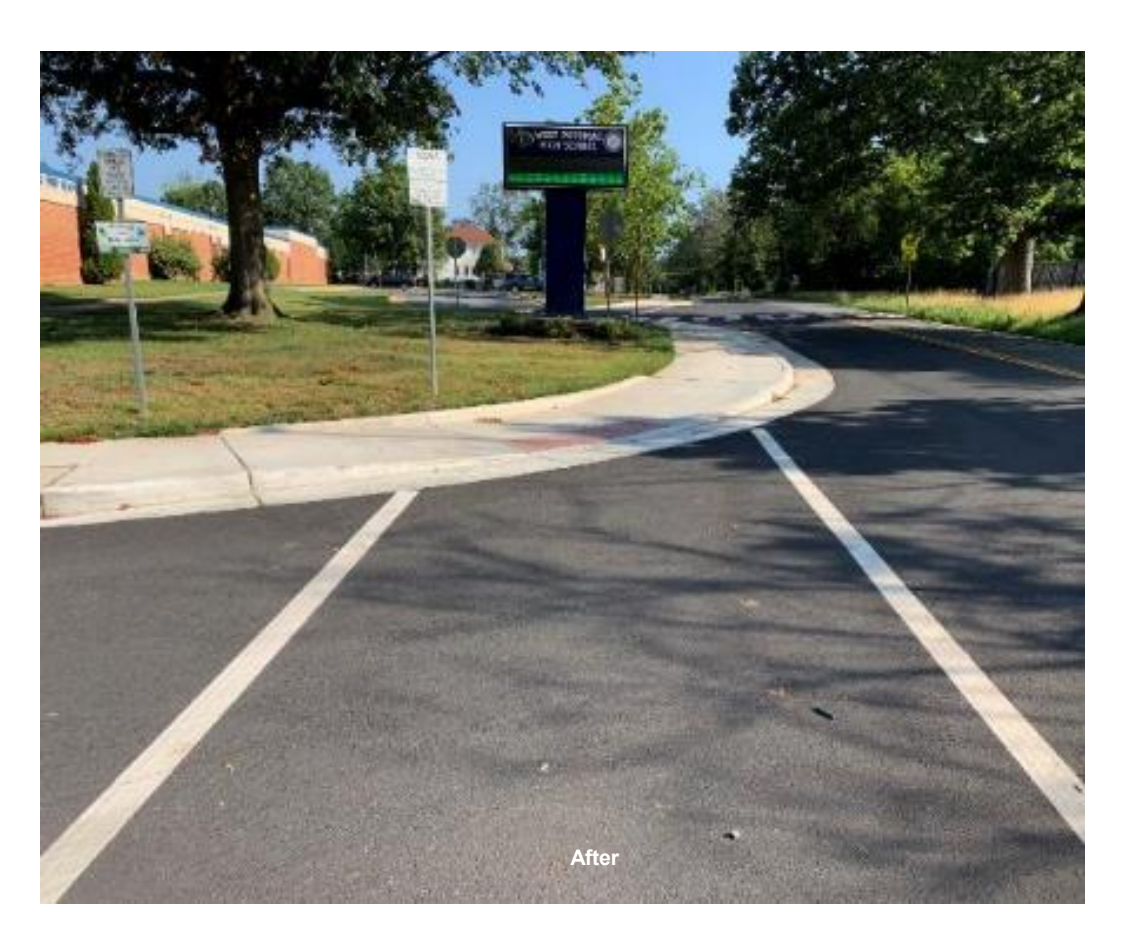
Quander Road at West Potomac High School, Belle Haven