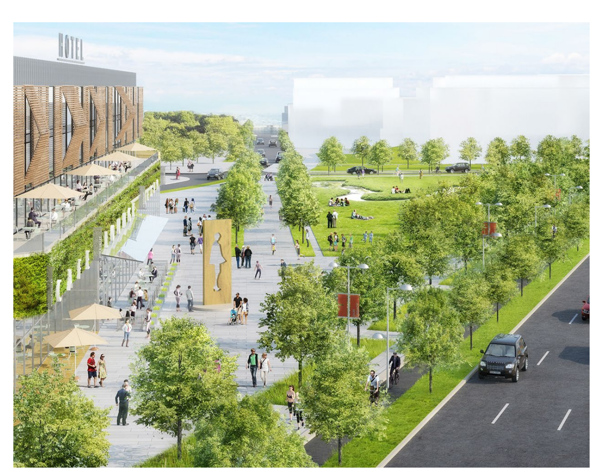
Embark vision of a multi-modal Richmond Hwy