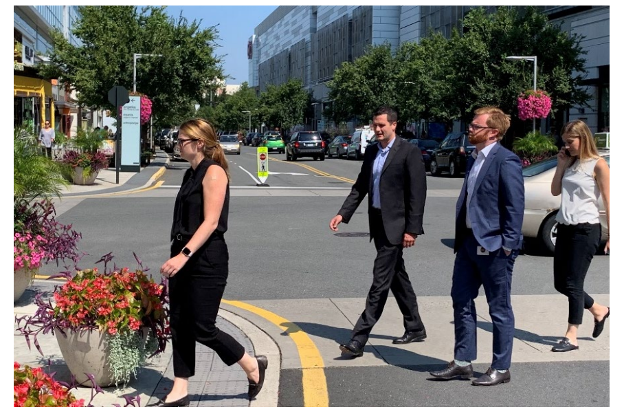
District Avenue, Merrifield