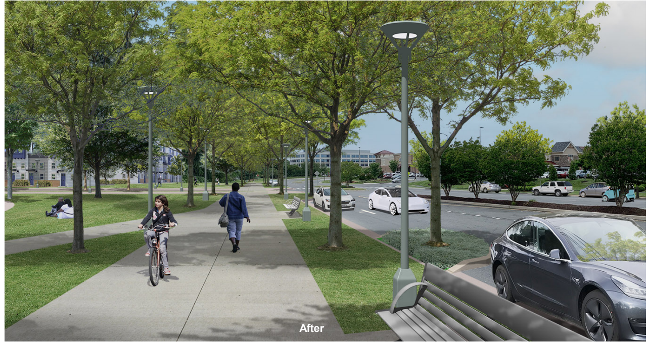
Example of a suburban "Complete Street"